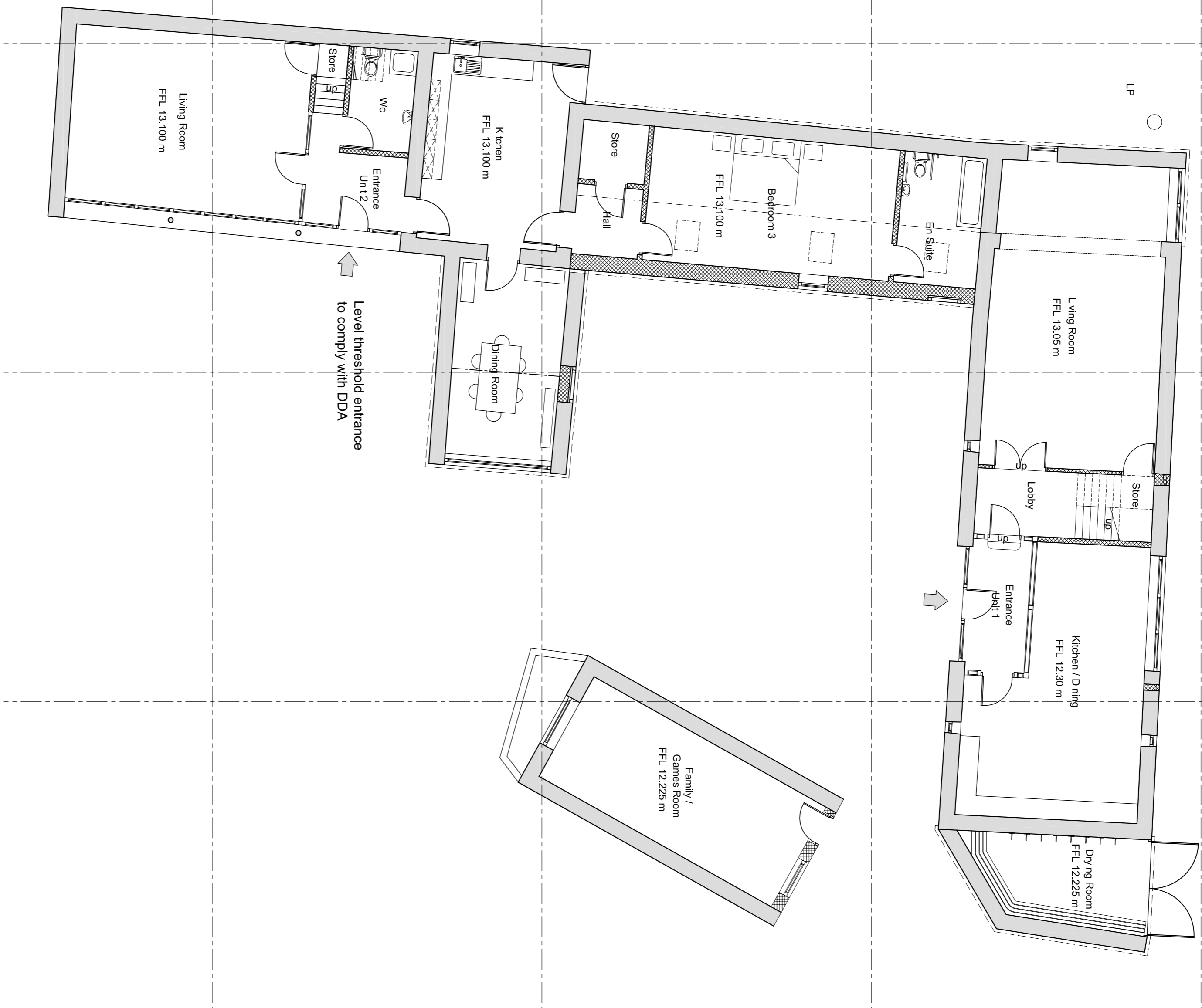
Ground Floor Scale 1:100